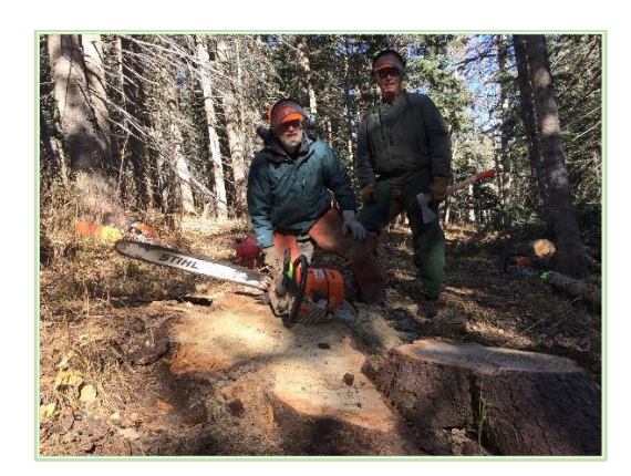
Members of FOSM low cutting and removing tree stumps from the groomed trails.