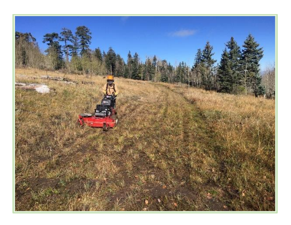
Sandia Nordic using USFS equipment to mow the meadow trails.